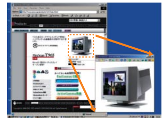
Image captured and displayed in overlay window.

EIZO's new viewing software 1 can display a JPEG or bitmap image, or any selected part of the screen, in an overlay window to a maximum brightness of 230 cd/m 2 , as well as enlarging or reducing it and freely altering its brightness, contrast, chroma, hue and gamma values 2 . Because DesktopViewer uses the graphics card's video memory, capturing an image and changing its size are performed more quickly and smoothly than with conventional software.